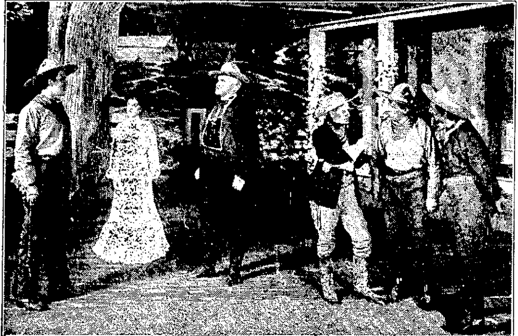
Scene from "The Virginian," New Adler Opera House, Sat. Night, Sept. 6